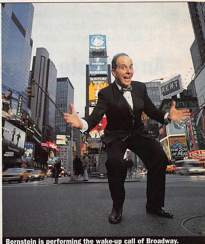
Bernstein is performing the wake-up call of Broadway.

"Broadway theater needed to create innovative ways to solidify its image," recalls Bernstein. He set about the task the same way an ad person sets about selling blue jeans or cars: by creating a strong and attractive image for