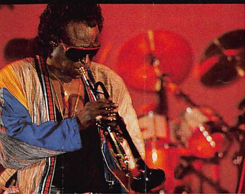
The man with a horn: Miles Davis.

On Mar. 24 Sony Music's Legacy label released The Miles Davis Quintet, 1965-68: The Complete Columbia Studio Recordings , a six-disc set that captures all the band's music and then some. The collection (price: $109.98) clocks in at 440 minutes, chronologically